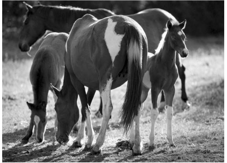
Mares and foals graze peacefully in their safe haven here at the Wild Horse Sanctuary.

Since my last writing the future of the wild mustang continues to be perilous as S. 1579, the Restore Our American Mustang (ROAM) Act, continues to sit idly in the Committee on Energy and Natural Resources. If passed, the amendments included in the ROAM Act would prohibit the BLM from euthanizing healthy horses, implement reliable scientific data and research to aid the BLM with realistic equine management, and restore the land to the wild horses that belong on it. In order to make these vital changes happen, public support is needed now more than ever. Without an outcry from the people, the wild mustang will continue to be subjected to terrorizing round-ups and a dismal existence in inadequate holding facilities before their ultimate extinction. (Please see our insert for what you can do.)